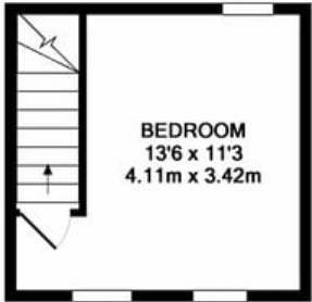
2ND FLOOR APPROX. FLOOR AREA 148 SQ.FT. (13.8 SQ.M.)