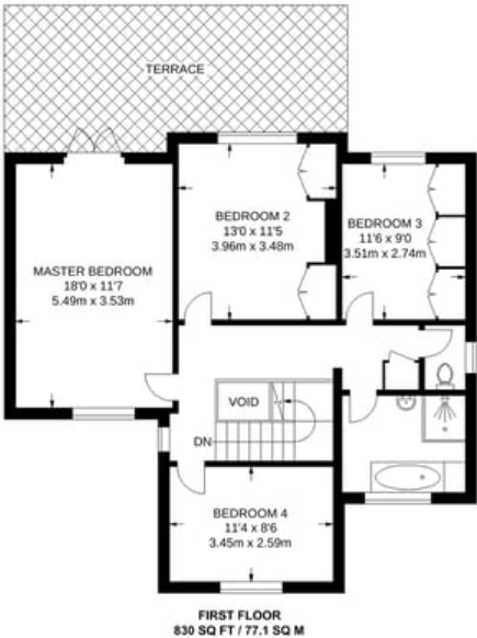
FIRST FLOOR 830 SQ FT / 77.1 SQ M